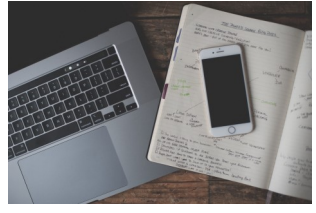
Delivering Tech support in Zeeland and East Flanders