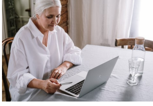
Digital Ambassadors in Kent